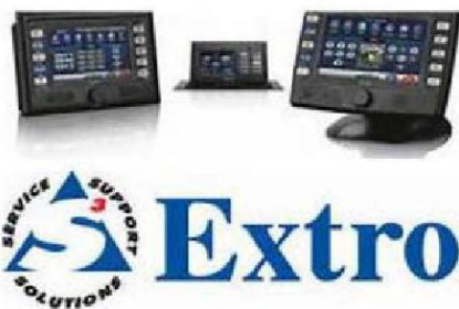
AV Control System

Conventional Center, Stadium Shopping Mall