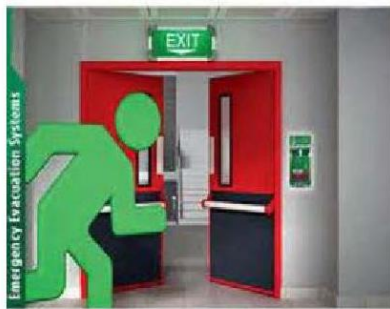
Public Address & Voice Alarm System

School, Hotel, Restaurant Airport, Train Station